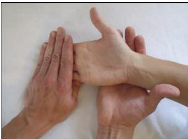
Figure 4. The application of muscle energy technique. The physician stabilizes the proximal and distal interphalangeal joints as the patient performs an isometric contraction at the metacarpophalangeal joints. The contraction is held 2 to 3 seconds and is repeated 3 to 5 times for maximal lengthening effect.

be addressed by targeting and inactivating the trigger points within the muscle itself with prolonged ischemic pressure, needle injection of the triggers, and stretch and spray techniques. 18 Cumulatively, these factors support the use of ultrasound-guided dry-needle aponeurotomy in conjunction with ultrasound-guided lidocaine injections and OMT as potential alternatives to open surgical aponeurotomy or fasciectomy.