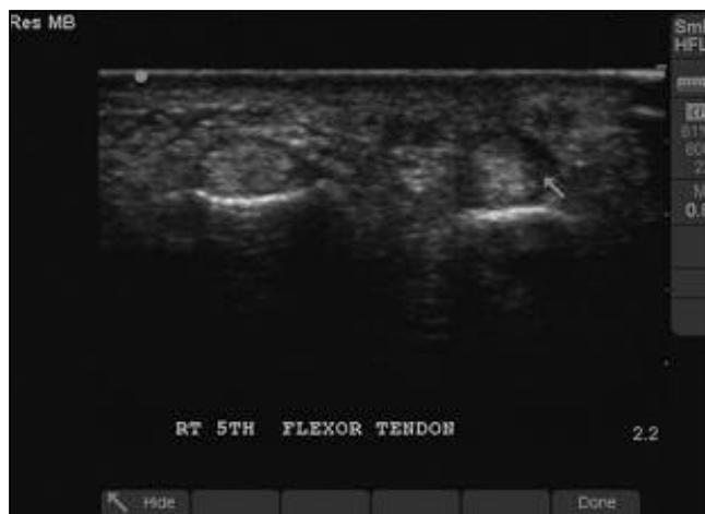
Figure 2. Ultrasound image of an affected tendon in the hand of a 64-year-old woman with Dupuytren contracture 8 weeks after completion of dry needling treatment. The image reveals a reduction in fibrous nodularity. The arrow points to a small artifact of initial nodule. Image was taken with a 13.0-MHz high-frequency linear transducer (Micromaxx; Sonosite Inc, Bothell, Washington).

the affected digits. However, with passive range of motion, she was able to achieve full extension without pain. During the fourth week of treatment, an 18-gauge needle was used for the aponeurotomy, the intention being that a larger bore needle would provide greater release of the fibrous scar tissue. At the last round of injections and manual therapy, an audible and palpable crepitus was noted during myofascial release, and the affected tendon sheaths were brought into full extension with active range of motion (Figure 1). The patient denied experiencing pain or discomfort immediately after the final treatment.