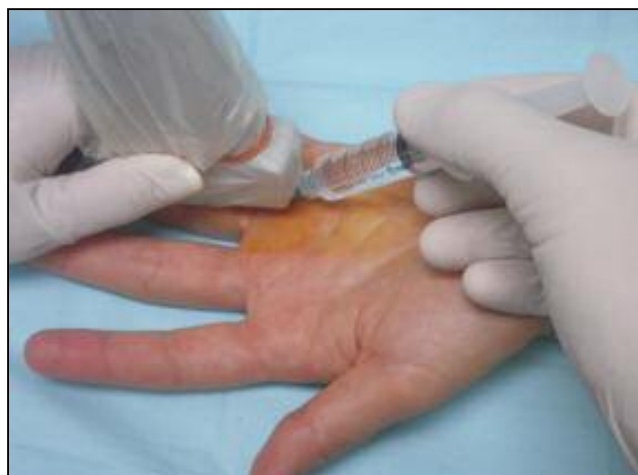
Figure 3. Lidocaine injection technique with dry needling using ultrasound guidance to optimize visualization of cord tissue.

Direct myofascial release should be administered immediately after muscle energy. This treatment protocol provides maximum correction of the fascia contracture by engaging the restrictive barriers of the palmar fascia with continuous palpatory feedback to achieve free movement of the tissues. 15 Myofascial pain syndrome of the palmaris longus muscle may